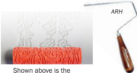
Shown above is the AR01 "Baroque" Art Roller.

AR1 - AR30 are $12.95 ea The Handle (ARH) is $6.95